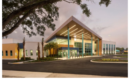
City of Palm Beach Gardens - Burns Road Community Center