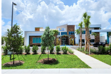
Broward County - Nancy J. Cotterman Center